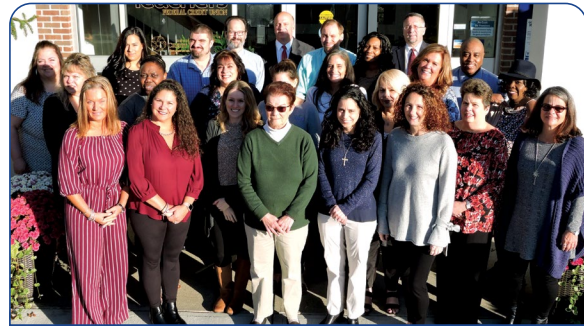
Your WCTFCU Team